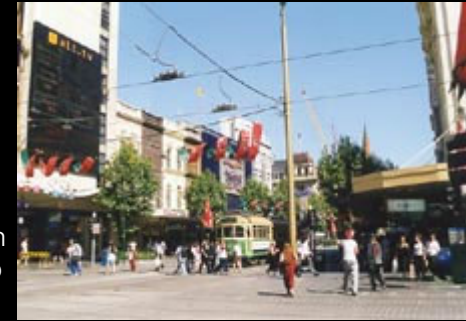
view of the bourke and swanston street intersection