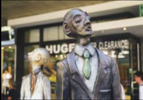
some of the pedestrians watching alt-tv